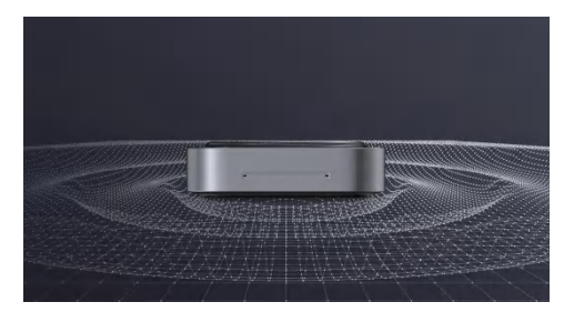
> Superior Treble and Bass