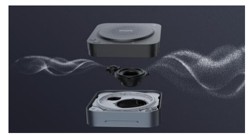
> Tweeter + Woofer Combo Speaker